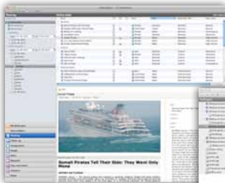
NewsGate- complete overview of content, resources and information