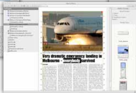
NewsDirector: Create, edit and publish content