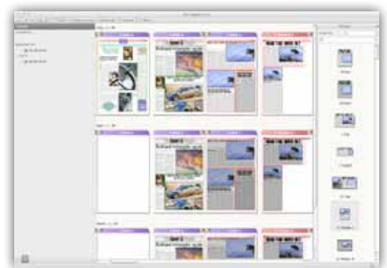
In PageDirector, users can drag and drop editorial content into article shapes and place ads on the page.