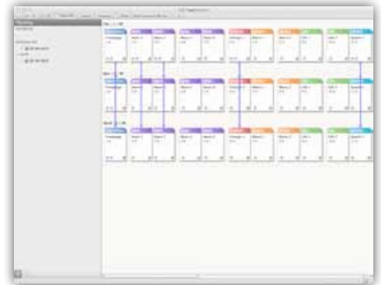
In PageDirector, users can create the current product by selecting pages from default page plans. Sourcing relations can be defined and visualized.

When a user marks an article for assignment, the underlying structure enabling a collaborative workflow in NewsGate is automatically created when the page plan is executed. This means that an assignment link to the relevant user and an entry in the editorial budget are created, a Story Folder serving as the working environment for further work on the story is created, etc.